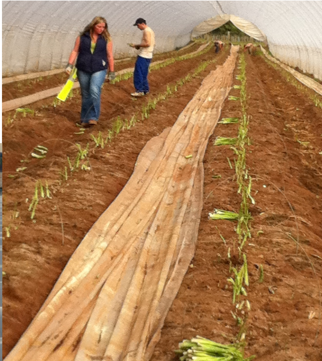
Harvesting reverse season green asparagus in a polytunnel in September