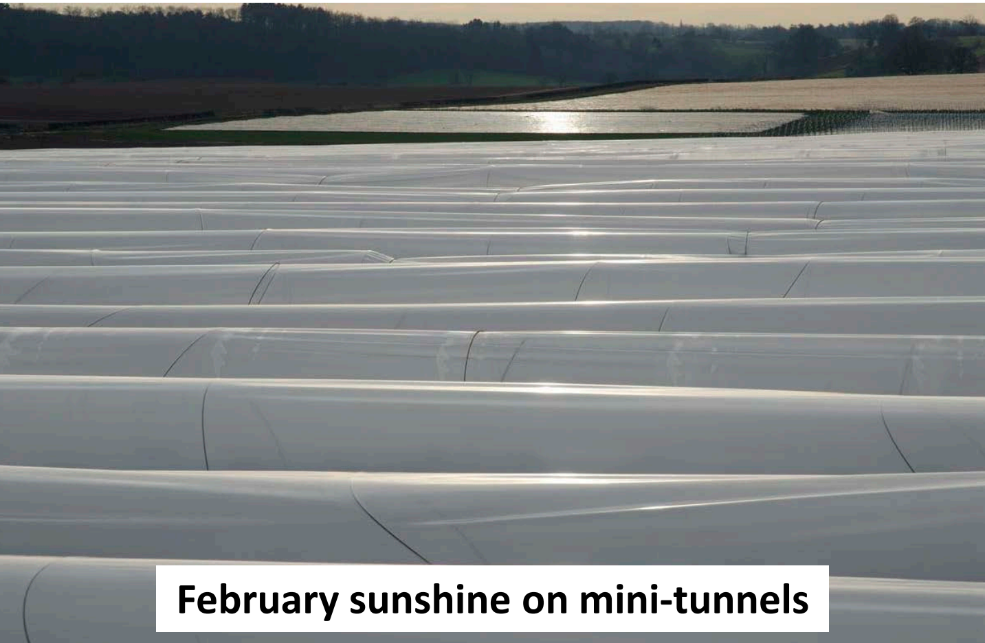
February sunshine on mini-tunnels

Although the arrival of the first British asparagus is still celebrated every year, the supermarkets are increasingly resistant to paying a premium price for early or late UK asparagus, preferring to sell imported product from Peru or Mexico at a lower price.